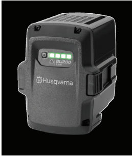
BLI200 BATTERY 967 09 19-01