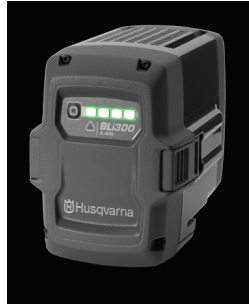
BATTERY BLI300 967 07 19-01