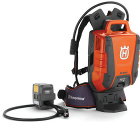
BLI950X BACKPACK BATTERY 967 09 32-01