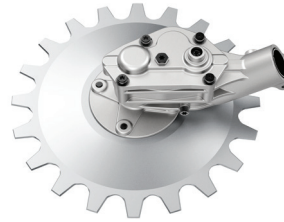
HUSQVARNA WEED SCISSOR GEAR ATTACHMENT RA-V 967 90 86-01