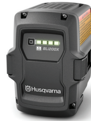
BLI200X BATTERY 970 44 89-01