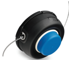
T35X TAP-N-GO™ TRIMMER HEAD (BALL BEARING) 578 44 65-01