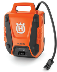
BLI950X BACKPACK BATTERY MODULE 579 82 22-01